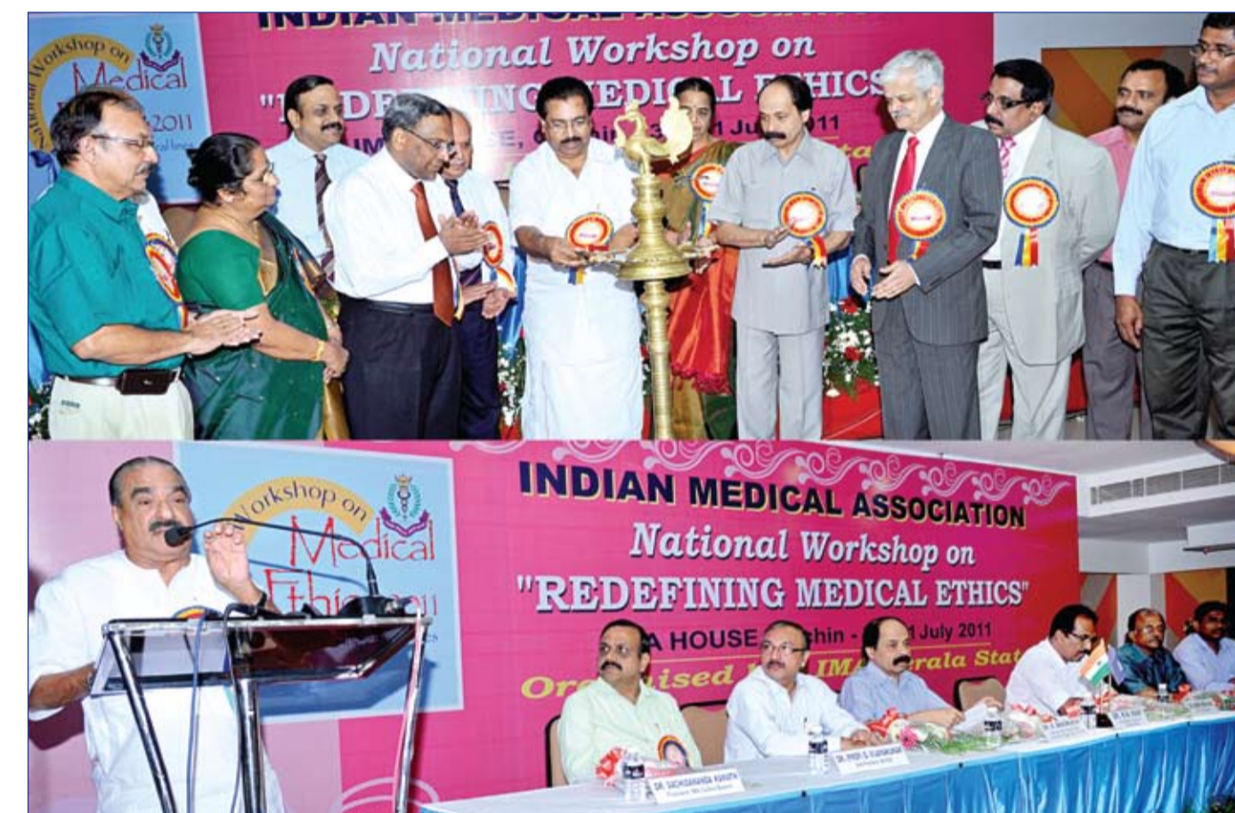
Shri P. C. Chacko MP inaugurates the National Workshop on Redefining Medical Ethics and Shri K.M. Mani, Finance Minister at the valedictory function at IMA House