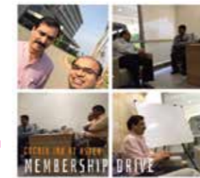
Memberships Drive by IMA Cochi at Aster Medcity