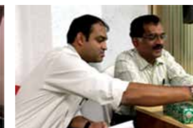
Cochin Clinical Society-IMA AMS monthly meeting held at Sree Sudheendra Medical Mission Hospital on 5 March 2015