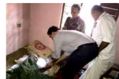
IMA Cochin Charity Fund: President visited and donated cash to an old woman on 11.3.15