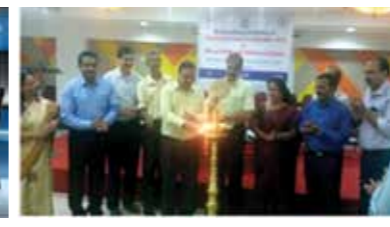
Seminar on Child abuse at IMA House