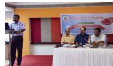
IMA State committee for Organ donation at Cochin IMA House 29.3.15