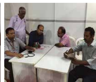
Mega Medical Camp at Kadavanthra on 3.5.2015