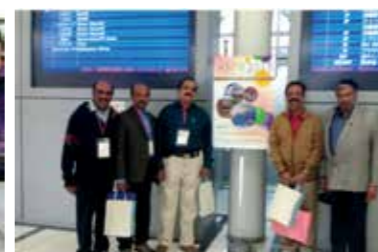
Cochin IMA's delegates at International Pediatric conference

Teaching Pearls 20 of 24 (This is part of an ongoing awareness series for road accident prevention. Please use this to educate teenagers and younger drivers in particular)