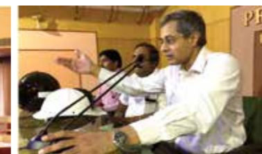
Press conference on Road Safety