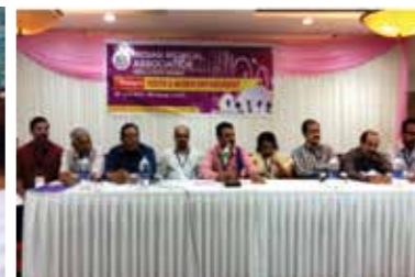
Workshop on Youth & Women empowerment on 26th April at IMA House, organised by IMA Kerala State Branch