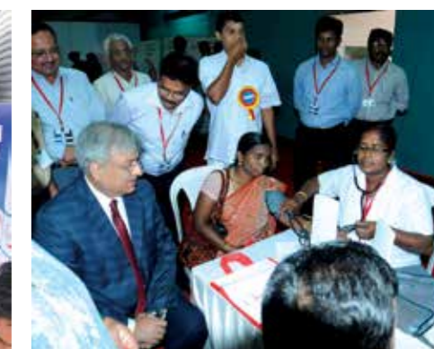
Mega Medical Camp together with Press Club, Ernakulam