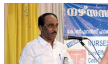
Nurses Day Celebration