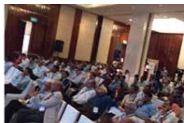
LIGHT: Gastro CME at Cochin by Lakeshore Hospital with international faculty