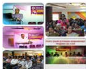
Cochin IMA Youth & Women Empowerment Programme