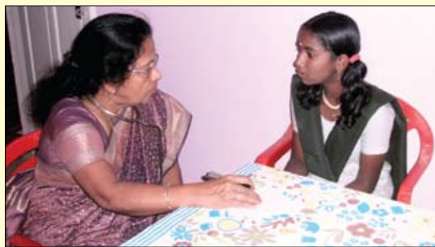
Medical check up and Adolescent Health Education Programme in progress at Mathrusakthi, Aluva

The next meeting will be on 'Variety Cooking' by Nestle at IMA House, Kaloor on 22.8.2009.