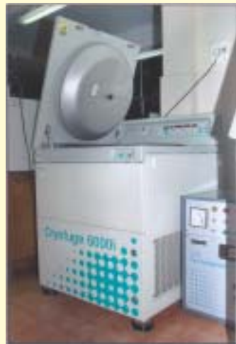
The cryo centrifuge for component separation