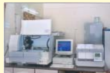
The tektime for Elisa and Minividas for Infectious Diseases and Immuno chemistry