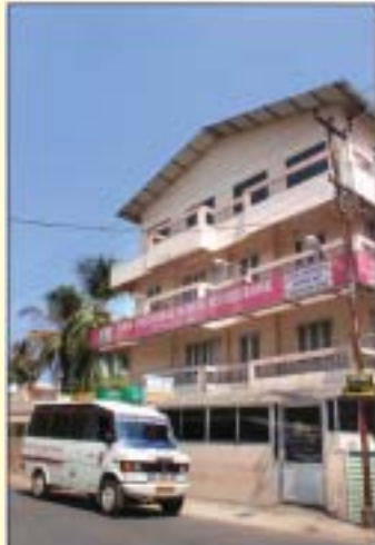
The Blood Bank with the Blood Mobile for out door collection.