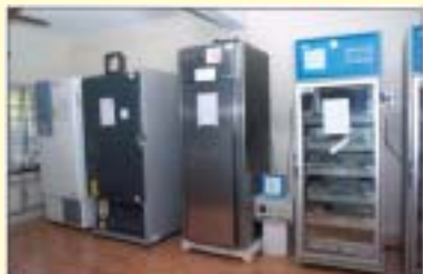
Deep freezer with temperature range of -40°C to -80°C

The Blood Bank adopts the latest techniques for screening of Transfusion transmitted infections viz. HIV, Hepatitis B, Anti HBC core and titre study, HCV, Syphilis and Malaria