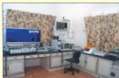
Best 2000 for Elisa and Coagulometer for coagulation

The Blood Bank adopts the latest techniques for screening of Transfusion transmitted infections viz. HIV, Hepatitis B, Anti HBC core and titre study, HCV, Syphilis and Malaria