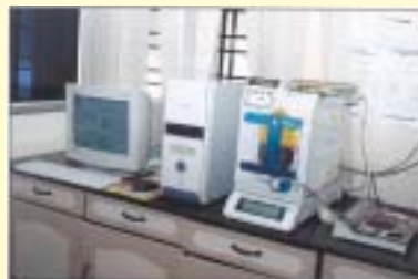
The opti press II The only Blood Bank that provides Leuco Reduced product in Kerala.