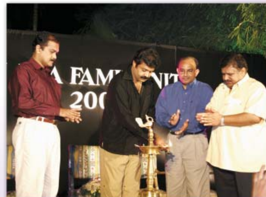
Mr. Suresh Gopi, Cine Artist, inaugurating IMA Family Nite 2006