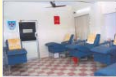
Bleeding Room with the donor couches & shaker monitor